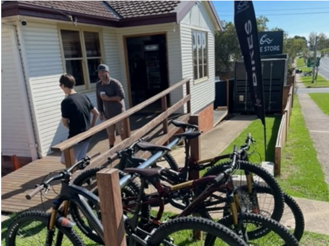
Image: Ride Creative Lines Bike Store

Discover what's been happening across the tourism industry within the Destination Southern NSW network. To share news of your new product, experience or event, please email Tash via comms@dsnsw.com.au